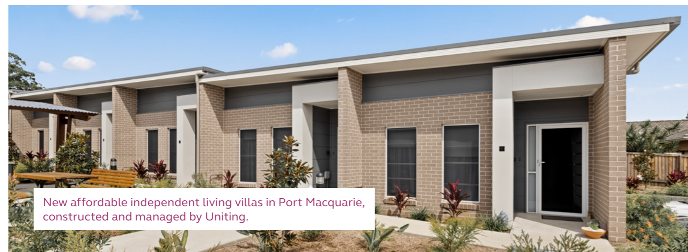
New affordable independent living villas in Port Macquarie, constructed and managed by Uniting.